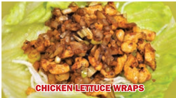
CHICKEN LETTUCE WRAPS