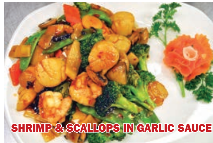
SHRIMP & SCALLOPS IN GARLIC SAUCE