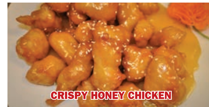
CRISPY HONEY CHICKEN

We can alter hot & spicy upon request BROWN RICE AVAILABLE *CONTAINS PEANUTS OR PEANUT PRODUCT ANY MEAT CAN BE SUBSTITUTED FOR TOFU